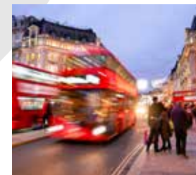
LONDON WEST END